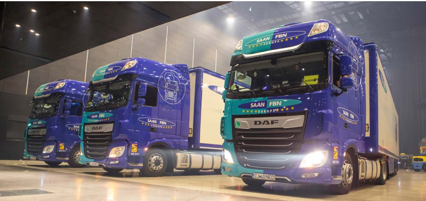
Saan FBN's units criss-cross Europe and form the backbone for successful performances by bands, orchestras and pop stars