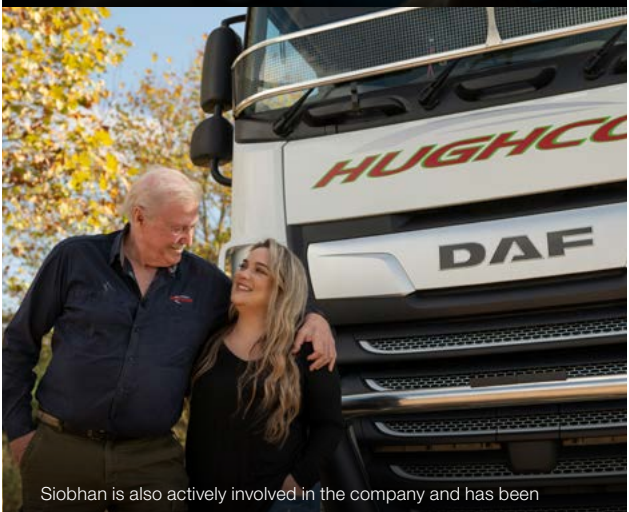
crazy about trucks since she was ten

from 25 years ago when she would lean out of the window of her dad's old DAF