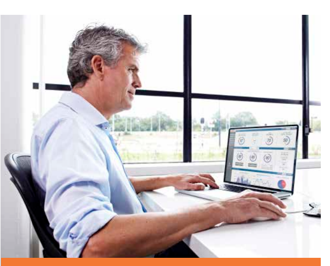
picture of the logistic processes and to get the best out of their people and vehicles

Simultaneously with the launch of the XF, XG and XG+, important steps were taken with regard to the services that accompany this new generation of trucks. The list of innovations is long, says Zink. One example is the DAF Connect on-line fleet management system. "A platform that provides continuous updates on a fleet's performance," he explains. "This helps the customer to maintain a clear picture of the logistic processes and to get the best out of their people and vehicles. For instance, DAF Connect enables the navigation system to display real-time traffic information and allows the home base to provide drivers with the best routes. Imagine how much fuel, time and frustration that can save."